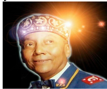
The Honorable Elijah Muhammad Messenger Of Allah

The Bible speaks of separating the sheep from the goats. He (Allah) will kill goats and save the sheep. It is speaking of separating the Black man and the white man. He (white man) is the goat and you and I represent the sheep. This is the great Day of Separation. We have